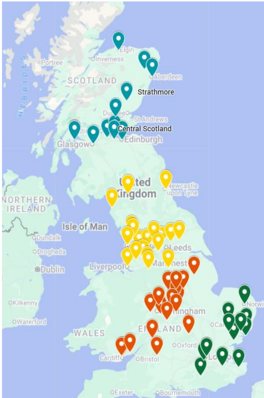
Map showing new regions: